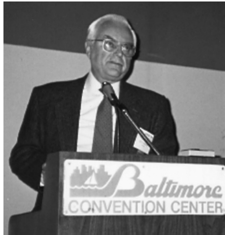
Fig. 2.3 In his rightful role as SETI Elder Statesman, Frank Drake still serves as keynote speaker at SETI conferences all over the world.

This, then, is Project Ozma's legacy: it, and Frank Drake, have turned science fiction into credible, respectable science.