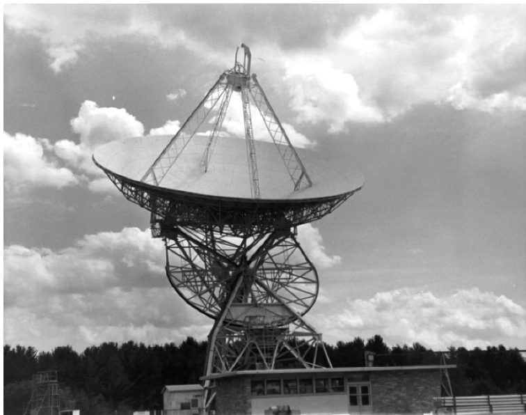
Fig. 2.1 The 85-foot diameter Howard Tatel Telescope at the National Radio Astronomy Observatory, Green Bank WV, used by Frank Drake for his Project Ozma observations in April and May of 1960.

his candidate stars, two nearby sunlike ones which he reasoned were likely to harbor habitable planets. He had selected his research methodology, and proceeded (very quietly) to assemble his listening station.