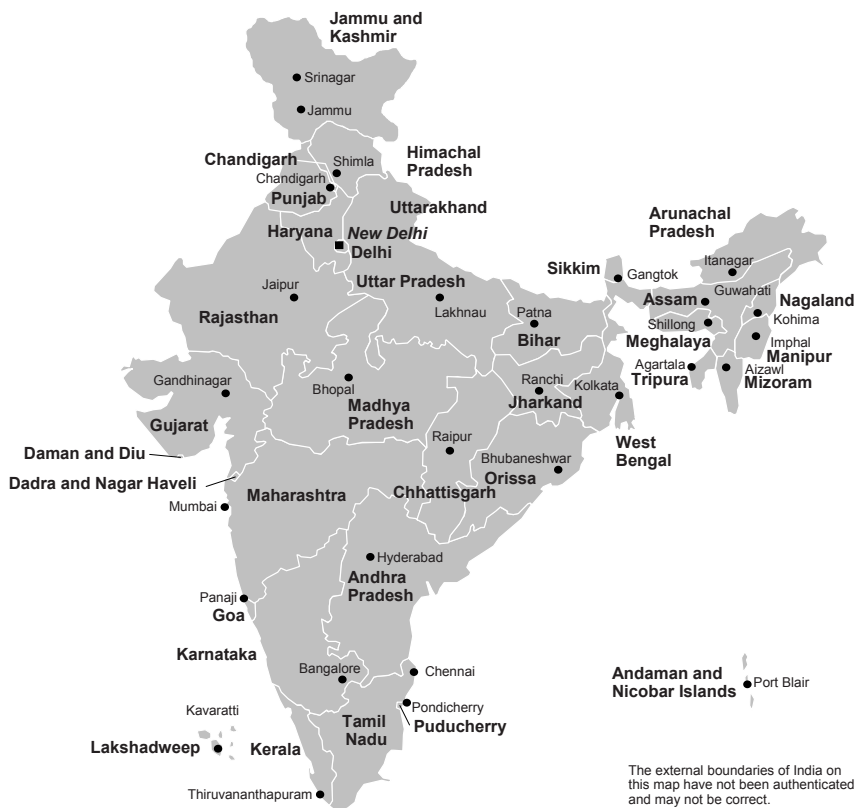
Figure 2-1. The Indian subcontinent

India is rich in minerals; with an estimated 200 billion tons, coal is India's most important natural resource. While there are also some supplies in iron ore, manganese, chrome, magnesium, bauxite, copper, lead, and zinc, India is a net importer for most resources. Crude oil is very rare which poses a big challenge for India's future economic development.