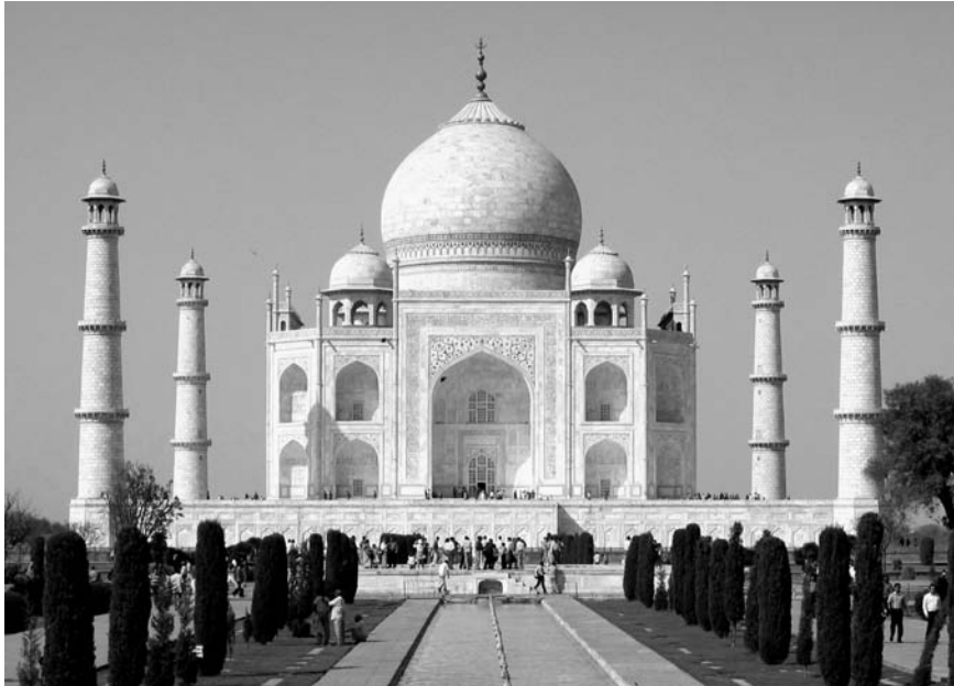
Figure 2-3. Taj Mahal 79

In Rajasthan, the Rajputs remained strong Hindu powers but eventually became vassal states of the Mughal empire. In central India, the Marathas gathered Hindu support under their leader Shivaji. Between 1646 and 1680, he did many heroic acts against the Mughals, was even taken prisoner by the Mughals but managed to escape from Agra Fort again. In the long run, they managed to undermine the Mughal empire by supplying troops and then actually taking control of the land. The expansion of the Marathas to the west was halted by Ahmad Shah Durani from Afghanistan in 1761, but at least they managed to consolidate their power in central India. Nonetheless, they did not manage to hold up against the British imperial power.