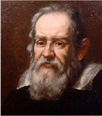
From Galileo Galilei portrait of 1636 by J. Sustermans, Hayden Planetarium, NY

Called the father of modern science by Einstein, Galileo pioneered scientific reduction-