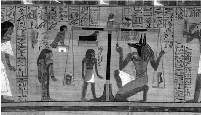
Fig. 2.1 Balance scale and god Anubis

object that has to be weighed is located on a pan while on the other pan are located weights having known value, until the yoke is horizontal. When the yoke is balanced, since its arms have equal length, the weights (and the masses) on both the pans are equal, hence the object's mass is given by the sum of the known weights on the other pan. Such a type of balance scale is common all-over the world and has been used for thousands of years by a great number of civilizations. In Fig. 2.2 are reported a roman balance scale now at the Museo Nazionale, Naples, Italy (on the left) and a detail of a Roman bas-relief showing a large balance scale.