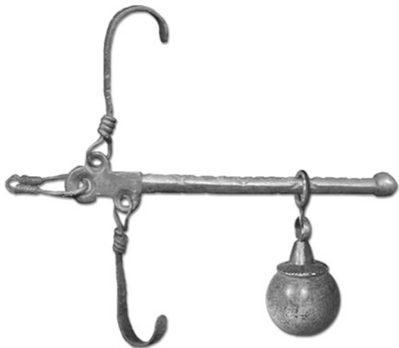
Fig. 2.4 Steelyard found at Hercolaneum

Also steelyards are still used; until a few years ago these devices were used in most country markets. Some modern steelyards are still built in small size to weigh the gunpowder charge to load the cartridges; these devices generally have a sensibility of 0.1 grain (=0.0065 g).