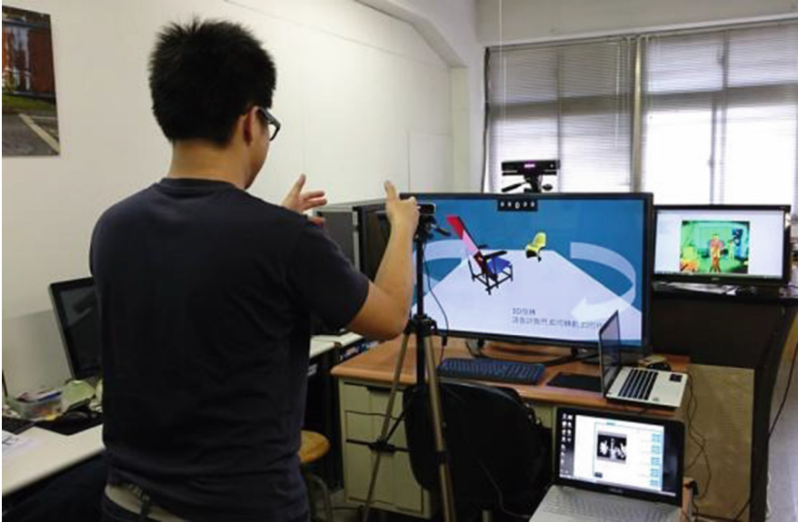
Fig. 1. Experiment setup

between the participant and the TV. The distance to the participant was adjusted with respect to the arm length. The height was adjusted to the shoulder height of each participant. The motion of each hand gesture was recorded by the Hands Viewer program. The program was running on a laptop computer with a 15-inch display, which was placed on the lower right hand side of the TV. Therefore, each participant performed the tasks of user-defined gestures by facing two 3D depth cameras with different distances. In addition, offering different gestures between two trials was encouraged.