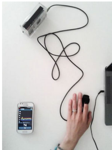
Fig. 4 Image of the CardioAlert prototype. On top left , the heart rate recorder that receives the changes in the hemoglobin detected by a led sensor connected to an individual’s finger. This signal is filtered, amplified and elaborated to obtain the heart rate by using an Arduino microcontroller. On bottom left , is the smartphone which receives the data from the microcontroller by a bluetooth connection

It may be possible to exploit these correlations between events separately in time for practical applications? For example is it possible to detect the neuro-psychophysiological reactions measured at time-1, to avoid negative events