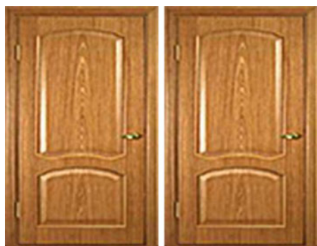
Fig. 1 A crucial task: if you open one door you are safe or dead

There is evidence that our neuro- and psychophysiological systems can react differently before the perception of two classes of events presented randomly,