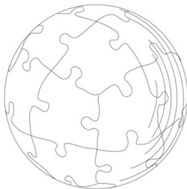
Fig. 2 One way of thinking about the foundations of physical theories would have it that some of the central principles of a theory have a distinguished status as the “truly fundamental” principles. An alternative view, which I describe and advocate here, is that the foundations of a theory are better thought of as a network of mutually interdependent principles, interlocking like the pieces of a spherical puzzle. On this view, one would tend to expect that any of the central principles of a theory should be derivable from the rest of the theory with that principle removed, much like the overall shape of a puzzleball constrains the shape of any individual piece

also be committed to the geodesic principle. One cannot freely change the geodesic principle without also changing the rest of general relativity: one cannot “fiddle” with the theory by (merely) replacing the geodesic principle with the assumption that free massive test point particles traverse some other class of curves—uniformly accelerating curves, say, or spacelike curves. The geodesic principle is not modular, in the sense that one cannot construct a collection of perfectly good theories that differ only in how they treat inertial motion. More, the theorems clarify precisely how it is that the geodesic principle “fits in” among the other central principles of general relativity.