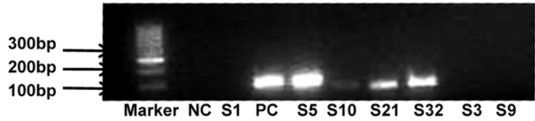
Fig. 1 Gel image of rhinovirus nested-RT-PCR products. The nasopharyngeal aspirate (NPA) samples (S) 1, 3, 5, 9, 10, 21, and 32 were collected from seven children with lower respiratory tract infection. Respiratory epithelial cells were collected from NPAs and processed for RNA isolation followed by nested-RT-PCR as described in Subheadings 2 and 3. PCR products were separated on 2 % agarose gel electrophoresis and visualized by ethidium bromide staining; the relevant DNA marker is indicated