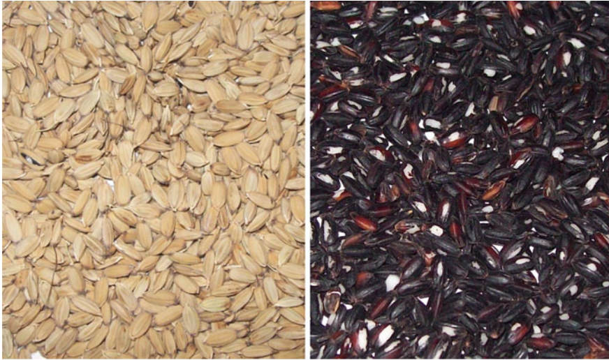
Fig. 2.1 A typical kernel of Chinese black rice with attached hull and dehulled

Black rice is typically sold as unmilled rice, means the fiber rich black husks of the rice are not removed. This rice is commonly used as a condiment, dressing, or as a decoration for different types of desserts in many countries around the world. The unusual colour makes it very popular for desserts and the high nutritional value is an added benefit. This rice is often served with fresh fruit such as mangoes and lychees, especially when drizzled with a fruit or rice syrup. Traditionally this rice has been used in China and Taiwan as dessert rice, but it can actually be used in almost any sweet or savory dish where plain rice would be used. Its pitch is black when raw, but it actually turns a beautiful, shiny indigo when cooked. Its flavor is richer and sweeter than white rice and its texture is slightly sticky. This short grain rice has a slightly nutty flavor, and its texture is smooth and firm. It is suitable for making porridge, dessert, traditional Chinese black rice cake or bread. Noodles also have been produced from black rice. Black rice is usually consumed mixed with white rice in Korea. The grain has a similar amount of fiber to brown rice and like brown rice, it has a mild and nutty taste.