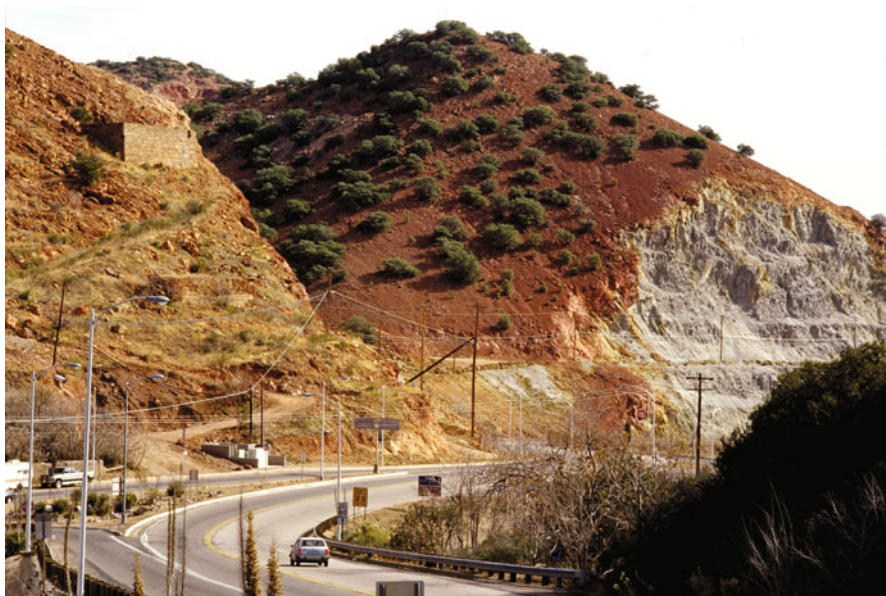
Fig. 2.1 The thin red layer is the gossan over the copper sulphide ore deposit at Bisbee, Arizona. The rock beneath this shows the typically bleached appearance of the supergene layer above the water table. The zone of supergene enrichment begins about 50 m below the level of the road.