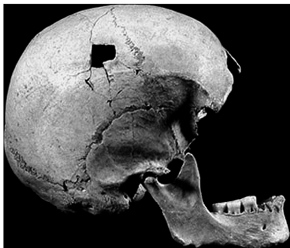
Fig. 2.1 The Stetten 2 skull from Vogelherd, Germany, attributed to the Aurignacian; the Stetten human remains are in fact all of the late Neolithic

The Cro-Magnon sample White cites, derived from four adults and three or four juveniles, had been subjected to so much pseudoscientific spin that separating it